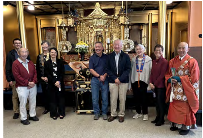
December (plus a few November B-days)

Please join us on Birthday Sundays and celebrate our sangha members' birthdays with us.