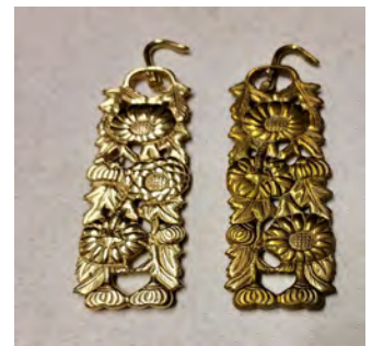
Image of before and after