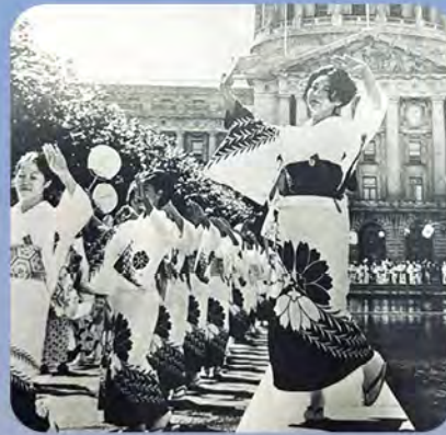
SF Civic Center, 1974, BCA 75th Anniversary Book